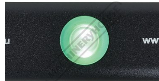
Power Light Indicator