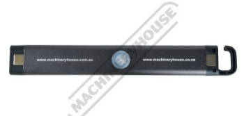
Two Magnetic Points