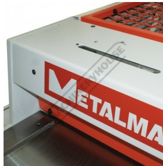
Material Viewing Windows