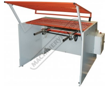
Hinged Rear Gate with Gas Strut Support