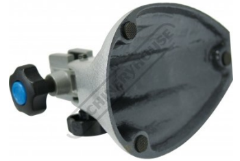
Rubber Foot Pads