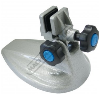
Front Angle View