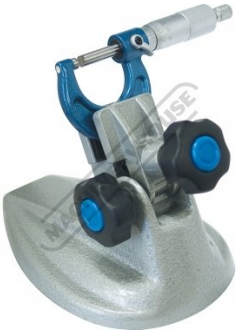
Shown with Optional Micrometer in Clamped Position