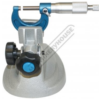
Shown with Optional Micrometer in Clamp Position