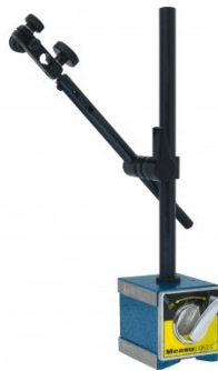
Q435 Magnetic Base - Large