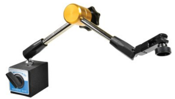
M051 Magnetic Base - Deluxe - One Lock