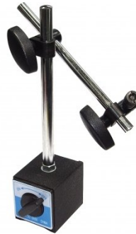
M050 Magnetic Base - Standard