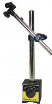
Q4351 Magnetic Base - Large