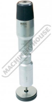
Shown with Setting Ring