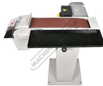
Side View With Lid Open