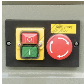
Safety Magnetic Switch