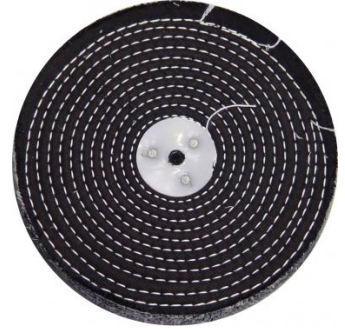
G174 Buffing Mop