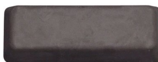
G323 Grey Buffing Compound