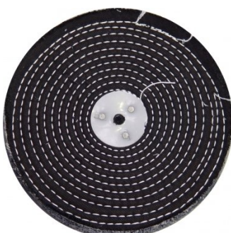
G186 Buffing Mop