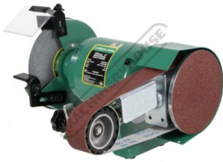
AA362W8 Abbott & Ashby Grinder & Linisher