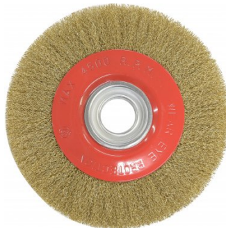
G188 Grinder Wire Wheel - Crimped