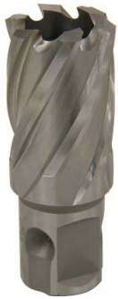
D9523 HSS Drill Broach Cutter