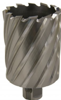
D9584 HSS Drill Broach Cutter