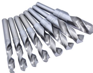
D117 Metric HSS Reduced Shank Drill Set