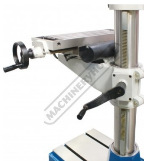
Rack and Pinion Wind Up Table