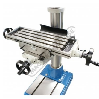
T Slotted Work Table