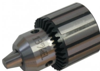
C290 Heavy Duty Drill Chuck - Keyed Type