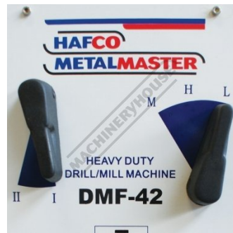
Gear Selection Levers