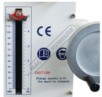
Adjustable Accurate Depth Setting For Increased Productivity