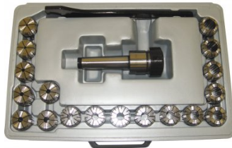
C926 Collet & Chuck Set - 20 Piece