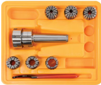
C922B Collet & Chuck Set - 8 Piece