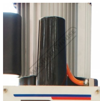
Drawbar for Milling