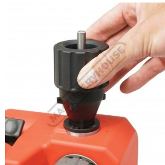
Facing the Back Angle Operation