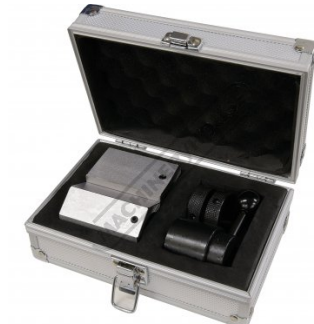
Aluminium Storage Case