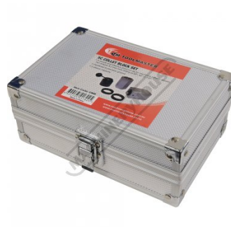
Aluminium Storage Case Closed